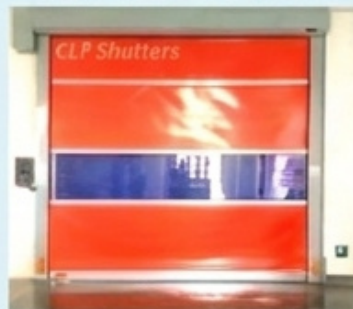
Red/Clear Sectional Rapid Door