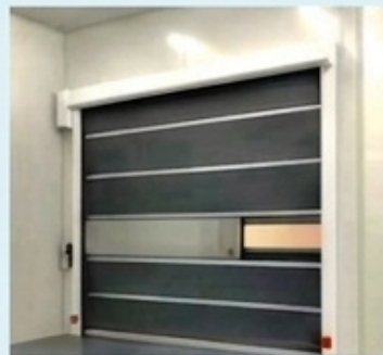
Standard High-Speed Door with Photocell Sensors