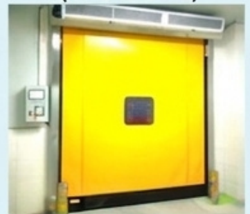
Yellow Single-Panel Rapid Door with Window